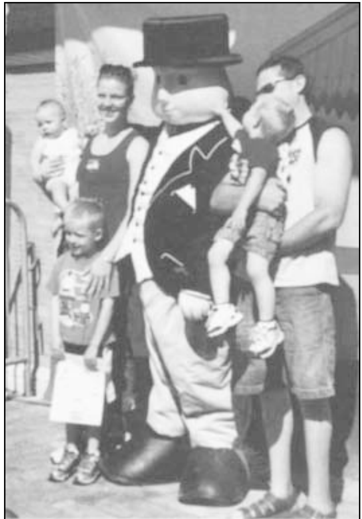
A HAPPY FAMILY poses with Sir Topham Hatt. 6/09