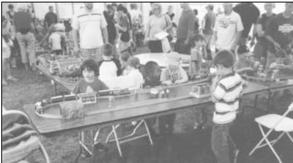
THOMAS FANS ADORE him, whether he is lifesize or model train size, as these children are enjoying. 6/09.