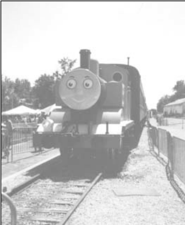
"THOMAS THE TANK ENGINE" taking a break between trips at Baldwin City, KS 6/09