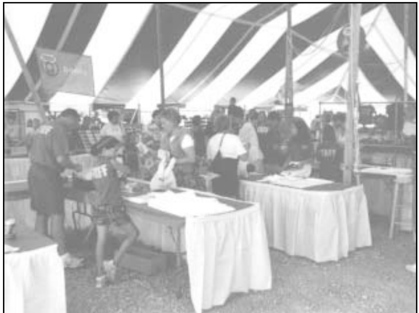
BUSINESS WAS GOOD inside the DOWT Gift Shop Tent. 6/09.