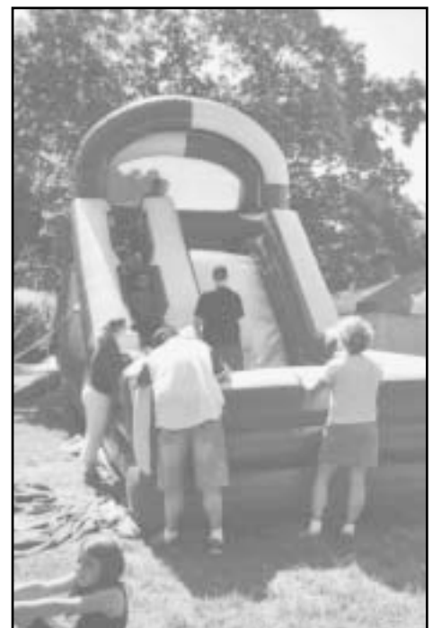
KIDS GET A REAL bounce at the DOWT "moonwalk" inflated playground. June, 2009.