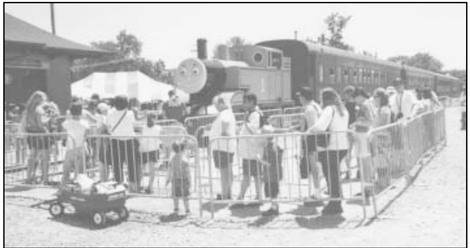
DEPARTING PASSENGERS waiting their turn to photograph their children with Thomas the Tank Engine. 6/09—photo by Charles Pitcher.

"happy campers" with our 2009 Scout Program, including Boy