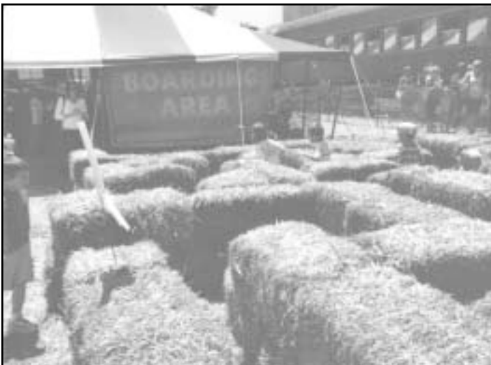
DON'T GET LOST! Kids going thru the hay bale maze while waiting their turn to enter the train boarding area.