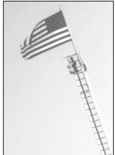
A MIDLAND TRADITION. Each morning opening DOWT festivities, the Baldwin City Fire Department raises the American flag atop their hook-and-ladder truck to the "Star Spangled Banner."