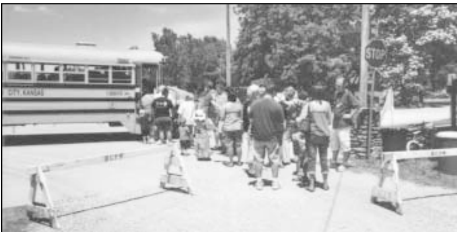
CROWDS BOARD one of the Baldwin school buses enroute back to their automobiles. Buses ran continuous shuttles throughout the event between the parking lot and depot.