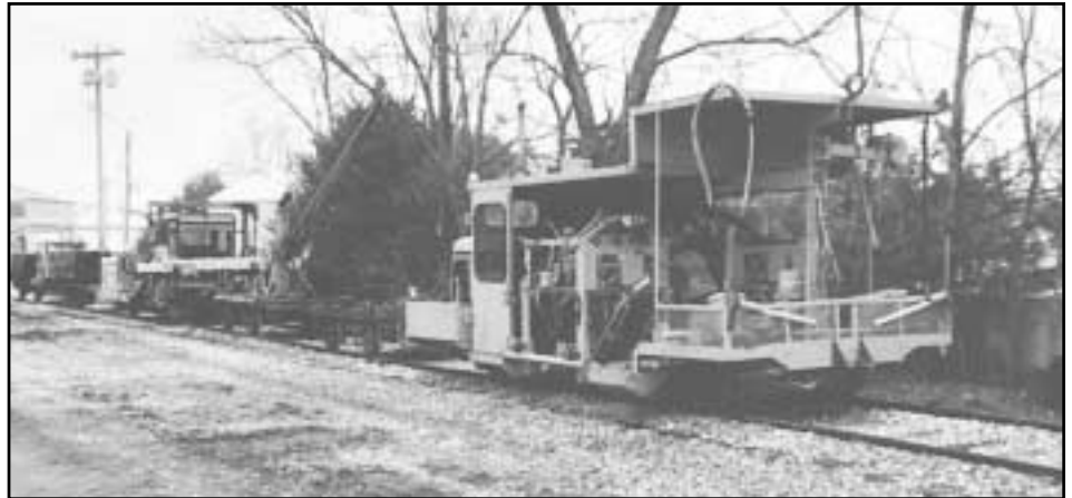
A COLLECTION of Midland's maintenance-of-way machines on the newly reconstructed "Cement Track" siding, Baldwin City.