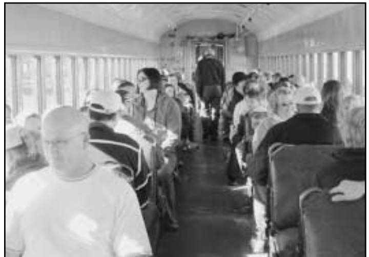
PASSENGERS WAITED PATIENTLY as the train was loaded to capacity for the third run of the Egg Hunt Train.