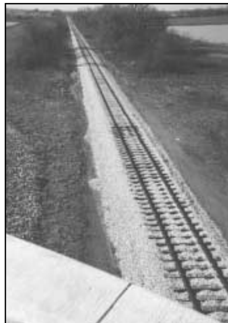
A NEW VIEW OF OUR TRACKS! Standing atop recently opened Highway 59 overpass, looking south toward Ottawa Junction. From up here, our track looks great!

Most notably, the new overpass over Midland track, just north of Reno Road, gives travelers a bird's-eye view of our right-of-way. Check it out on your next drive down to Ottawa!