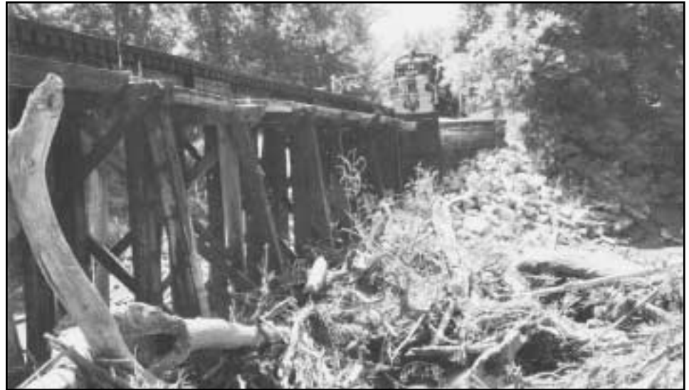
A VIEW FROM SUMMER 2009 , of how much debris had piled up under our bridge at MP 18.2 near county line.

Produced by Champion Publishing, Baldwin City, KS