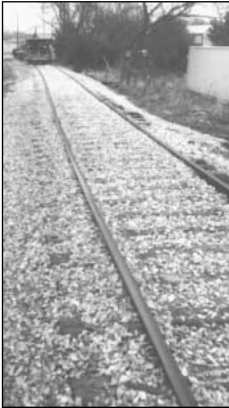
NEWLY RECONSTRUCTED "Cement Track" siding, Baldwin.