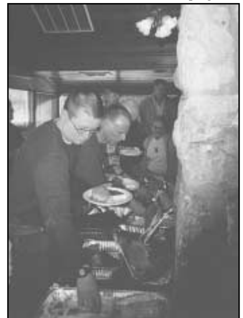
DIGGING IN! Members partake of the delicious BBQ dinner held at the conclusion of the Annual Meeting.