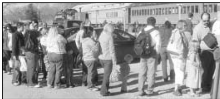
THE TICKET LINE FORMED early, stretching south well into the parking lot. This year every one got a ticket.