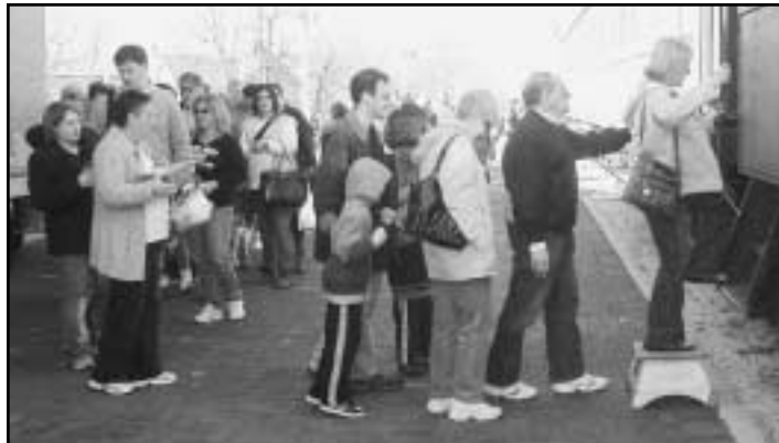
IT WAS A LITTLE COOL in the shade of the depot as early morning passengers boarded for their hunt.