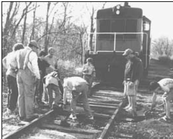
TRAIN CAN'T MOVE until ties are installed, boys," says Kevin Jones, supervising Boy Scouts during the Nov. 17, 2009, Train Camp.

Another camp is scheduled this spring for April 30-May 1 & 2; and three more camps in the fall.