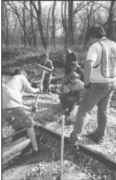
BOY SCOUTS WORKING as a team, spiking in a tie during Train Camp, Nov. 17, 2009.

The first Boy Scout camp scheduled for March 12-13-14 was cancelled about a week prior due to locomotive and weather issues beyond Midland's control.