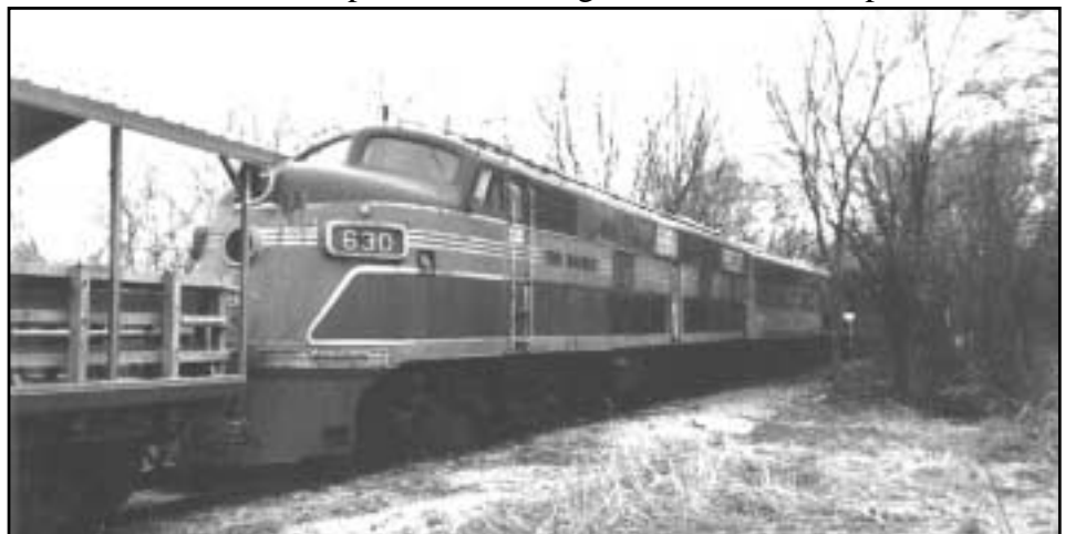
ROCK ISLAND 630 & 652 are now stored at Midland's Elm Street Yard, awaiting shipment to Iowa. 3/27/10.

Our neighbor, The Abilene & Smoky Valley Railroad, will operate their ATSF No. 3415 4-6-2 steam locomotive 10 AM & 2 PM, 5/29/10; 2 PM 5/30/10; 10 AM & 2 PM, 5/31/10. For more information, www.salinafyi.com/marketplace